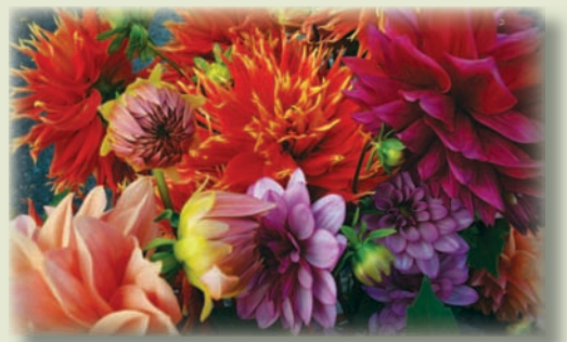
—Waynesville Tailgate Market

We encourage you to contact individual businesses to confirm hours, product availability & other details.