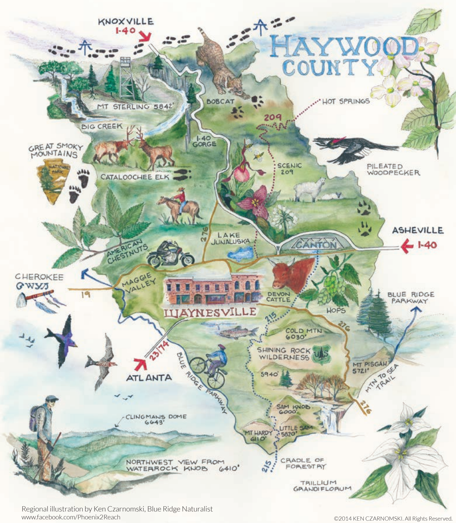
Regional illustration by Ken Czarnomski, Blue Ridge Naturalist www.facebook.com/Phoenix2Reach

©2014 KEN CZARNOMSKI. All Rights Reserved.